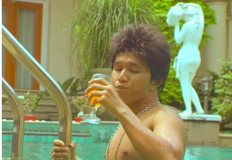
Sinema Elektronik, video single channel, 04' 19", 2009 Courtesy Anggun Priambodo

The video presented in this exhibition was made as a parody to Indonesian soap operas (called «sinetron» or «electronic cinema»). These soap operas are shown on almost all national television channels in Indonesia. They are incredibly popular and are always shown during prime time.