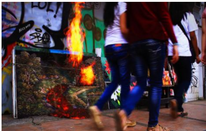
Liquefaction of Mooi #2, video, 2,02'30", 2013

He has a special interest in paintings that sold on the streets bearing themes of natural landscapes, especially street paintings found along Braga Street in Bandung, the city where he grew up and currently lives. What he found interesting about this painting is how these visual themes can be traced back to Mooi Indie. Mooi Indie is a chapter of Indonesian Modern Art History. Mooi Indie happened about a hundred years ago when Dutch colonized Indonesia. At the time, many Dutch painters came to Indonesia and were amazed by the natural beauty of Indonesian Landscapes. They expressed their reactions through paintings. Many Indonesian painters then copied these paintings so as to sell them to Indonesian and Dutch aristocrats. This practice continues until today. From generation to generation, these « street » painters copy previous paintings to make new ones, always with same visual theme, composition, and objects. As an artist, Pradipta does the same thing digitally, copying previous paintings to make a new artwork. Mooi Indie had many critics in the past.