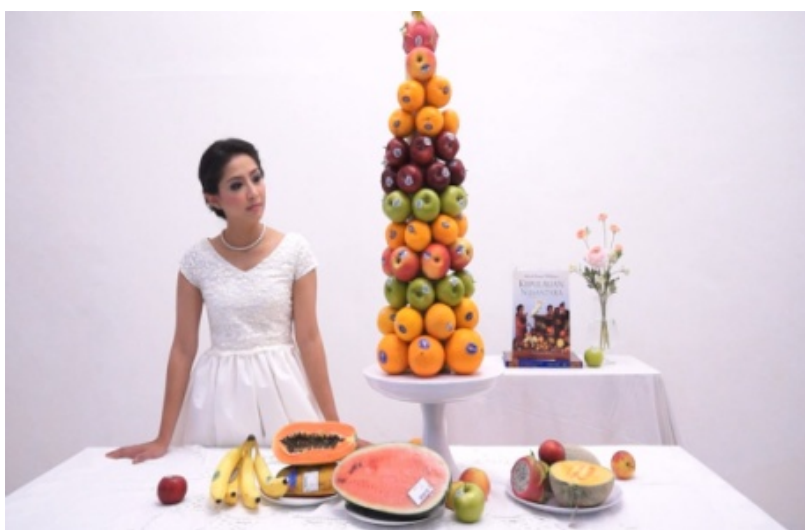
Branded Fruits Archipelago, Performance vidéo, 07' 09", 2012 Courtesy Krisna Murti

Murti's video Branded Fruits Archipelago describes the extreme situation where imported fruits not only affect the consumption of the population for their daily needs, but affect the shape, habit and behavior of ritual/spiritual community. Inspired by Edouard Manet's Impressionism painting « A Bar at the Folies-Bergere » (1882), a girl is seen stringing fruits - all branded, imported and non-native species - in an offering. This video describes the ritual: a celebration of a lifestyle of pragmatism and falsehood, and all the drama of human helplessness and confusion.