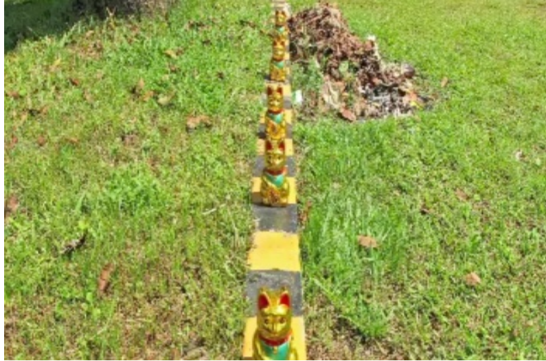
On progress, single channel video, 03' 05", 2013

Their video On progress shows that from time to time, every human activity tends to seek a progress. We're in a ship that is moving forward to a time and place where we imagine that it would be better than before. And we, as humans, become a role actor behind this movement. Most of the time, the meaning of the progress is more important than the meaning of the human itself. The ladder become a question mark about the meaning of progress that we constantly face in our daily lives.